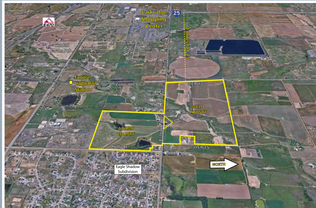
Boundary lines provided as a visual representation and may not be accurate. Consult broker for complete legal description.

The 431± acres is located on both sides of 168th Avenue between Colorado Blvd. and Holly Street. Approximately 140± acres is in Adams County in the City of Thornton. Approximately 291± acres in Weld County and can be annexed into the City of Thornton. Join the new communities of Lewis Pointe, Heritage Todd Creek, Cundall Farms and Morrison. Easy access to E-470, I-25 and DIA. Light Rail is being constructed to 124th Avenue and future plans call for a station at 162nd Avenue and Colorado Blvd. Offered at $40,000/acre or $17,233,000. (can be subdivided)