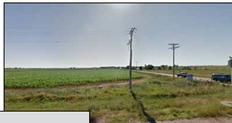
Looking east from WCR 13 at 168th Ave.