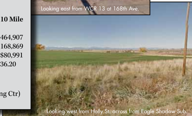
Looking west from Holly St. across from Eagle Shadow Sub.

E. 168th Ave. @ Hwy 7 - 29,816 vpd (at Larkridge Shopping Ctr)